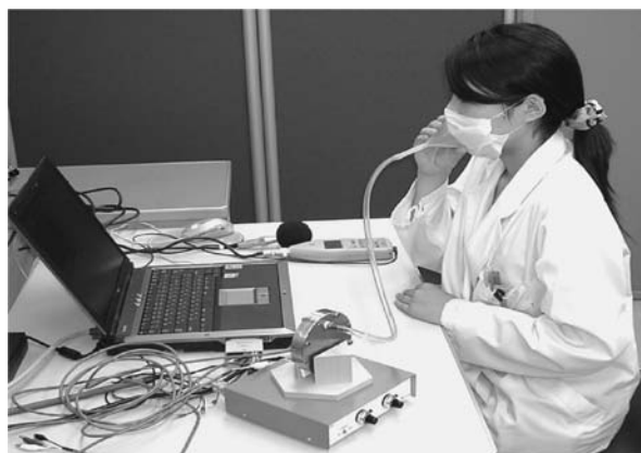
Fig. 1. A device for recording the cough-wind pressure. A subject wearing a mask holds a funnel in front of the mask.

The pressure levels with non-woven fabric and cotton-gauze masks were slightly lower than those with