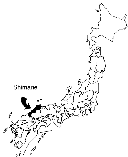
Fig. 1. Location of Shimane Prefecture in Japan.

Based on the questionnaire survey results, it was assumed that the outbreak started among children in the 1st and 2nd grades. Then the symptoms were reported among school-children in grades 3-6 (Fig. 2). When those who developed symptoms between February 10 and March 3 were considered to have group C rotavirus infection, this outbreak included 326 patients, consisting of 220 school children, 7