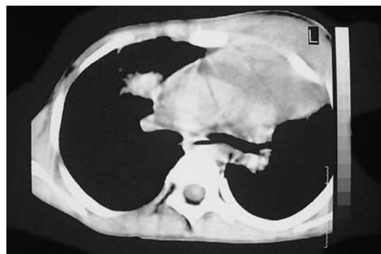
Fig. 2. Contrast-enhanced CT scan of the thorax obtained at the level of the left hilus and pulmonary truncus shows a soft tissue mass at the left anterior mediastinal region, left upper and middle zones, left anterior thorax wall, and a 2-cm nodular opacity at the right perihilar anterior localization.

normal limits. Purified protein derivative (PPD) for a tuberculous skin test was non-reactive and cultures for Mycobacterium tuberculosis were negative. Bone marrow aspiration showed no tumoral infiltration. Reexamination of the incisional biopsy showed fibrous connective tissue with intense mixed inflammatory cells and vascular proliferation. Actinomyces colonies were observed in necrotic exudative masses consisting of polymorphonuclear leukocytes and