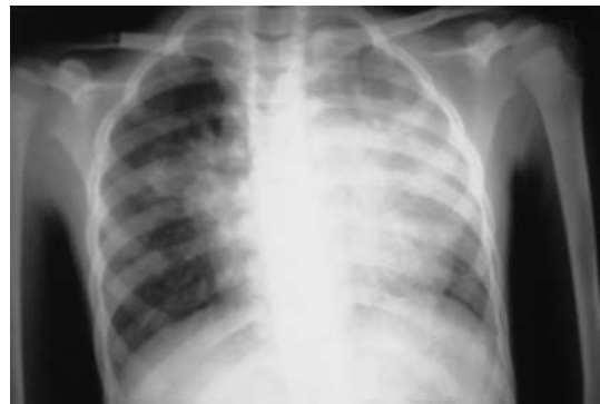
Fig. 1. PA chest X-ray: left upper and middle zone homogenous and right perihilar nodular consolidation.