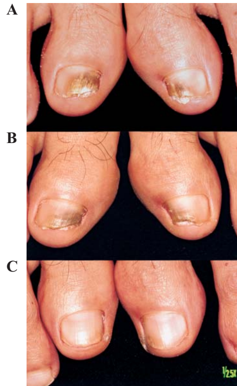
Fig. 3A. A 44-year-old male with toe-nail onychomycosis induced by T. rubrum . 3B. After 6 weeks of treatment with fluconazole 100 mg/week, the turbidity and thickness of infected nail improved. 3C. After being treated with fluconazole (57 capsules-5,700 mg in all) for 12 months, the toe-nail onychomycosis cured.

Fluconazole, however, is not yet approved in Japan for treatment of dermatomycosis. Further, the treatment regimen for onychomycosis in particular has not been established. Despite these circumstances, fluconazole has been widely used to treat systemic fungal infections, and the regimen of fluconazole once-weekly to treat onychomycosis was reported as early as in 1991 (7). Prior to this report, there were no Japanese reports available on treatment of onychomycosis at different weekly oral dosages of fluconazole in combination with topical therapy. The aim of this study was to determine an appropriate regimen of fluconazole for safe and efficacious treatment of onychomycosis.