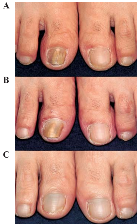
Fig. 2A. A 59-year-old female with toe-nail onychomycosis induced by T. rubrum . 2B. After being treated with fluconazole 300 mg/week for 3 months (16 times of administration in all), the turbidity at the toe-nail center became a line. 2C. After being treated for 8 months (40 times of administration with total dose of 9,600 mg) and discontinued administration for 4 months, the toe-nail onychomycosis cured.